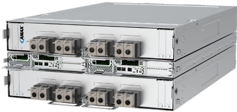
50U Compute Tray

Built on the open rack standard, the RackScale 128 leverages an open, modular design optimized for high-density deployments. The wider 21” rack format increases airflow efficiency, while front-to-back cooling and blind-mate liquid manifolds simplify integration and maintenance. The shared busbar architecture enables efficient 48V power distribution across compute nodes, reducing cable complexity and improving serviceability.