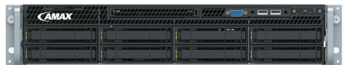
Figure 1: AMAX Deep Learning All-In-One

To help medical institutions promote AI technology in medical imaging applications and deliver AI capability for scenarios like AI-aided diagnostic imaging of pulmonary nodules, Winning Health has built the infrastructure platform with AMAX Deep Learning All-In-One, which is equipped with 2 nd Gen Intel Xeon Scalable processor and OpenVINO toolkit.